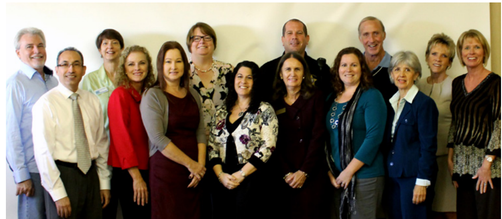
United Way of Martin County 2014-15 Board of Directors