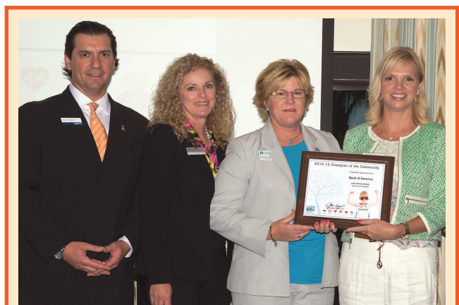
Bank of America brings in big campaign increase!