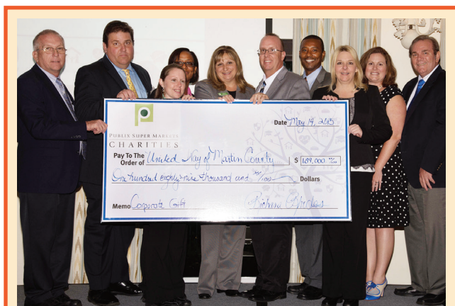
Publix Super Markets tops in giving

While every attempt has been made to ensure the accuracy of this listing, we apologize for any errors or omissions. Some Leadership Members who contributed through payroll deduction or gave their gifts through a corporate entity or foundation might not be listed, as United Way may not receive a complete record of these names. Please advise us of any corrections so we can recognize you next year.